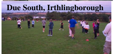
Due South, Irthlingborough